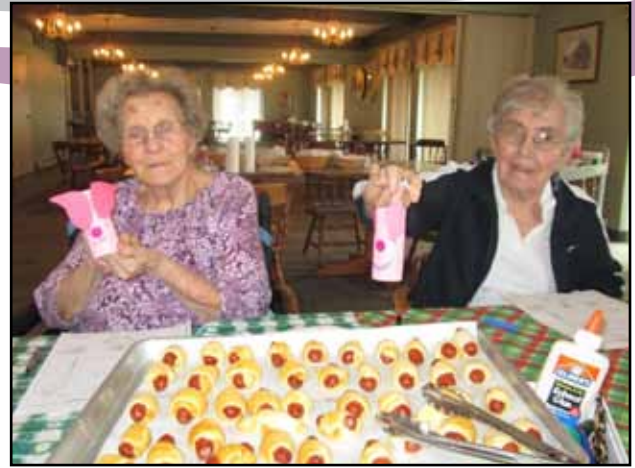
We celebrated National Pig Day here by making pigs and pigs in a blanket for snack.