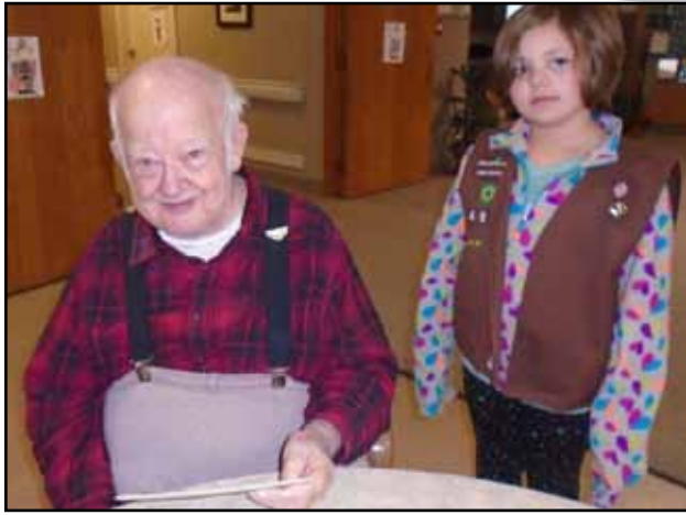
Herb gets a visit from one of the homeschool kids.