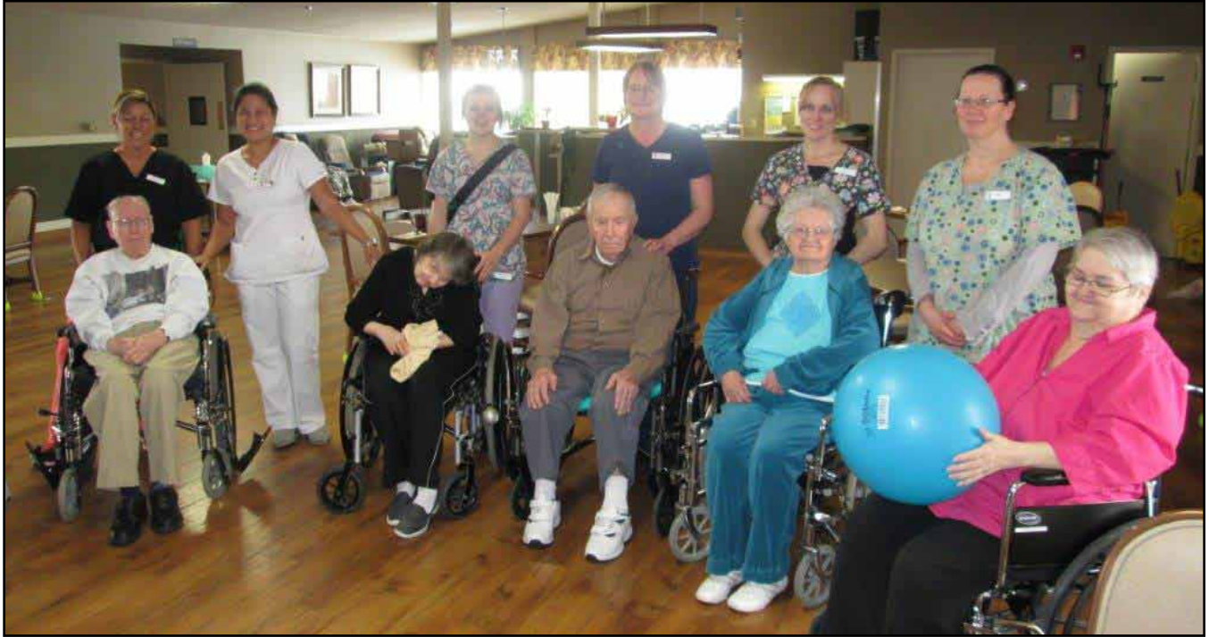
CNA's and nurses pose for a picture before the residents start exercise class.