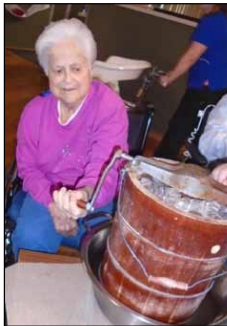
Nel also takes a turn at cranking the homemade ice cream.