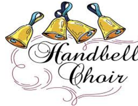
Harmony Bell Choir