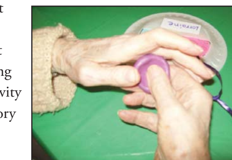
"Thumb Soothers" were made in Arts On Grand class.