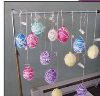
Our colorful, string art eggs.