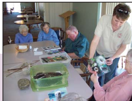
Clay County Conservation Bird display.