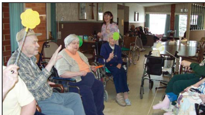
Ready, set... bat the balloons!